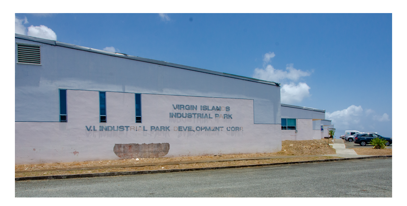
St. Thomas, U.S. Virgin Islands, April 19, 2021 -- FEMA has obligated $7.3 million through its Public Assistance Program for permanent repairs to the V.I. Industrial Park Development Corp. building in Sub Base. The building was damaged during hurricanes Irma and Maria in September 2017.