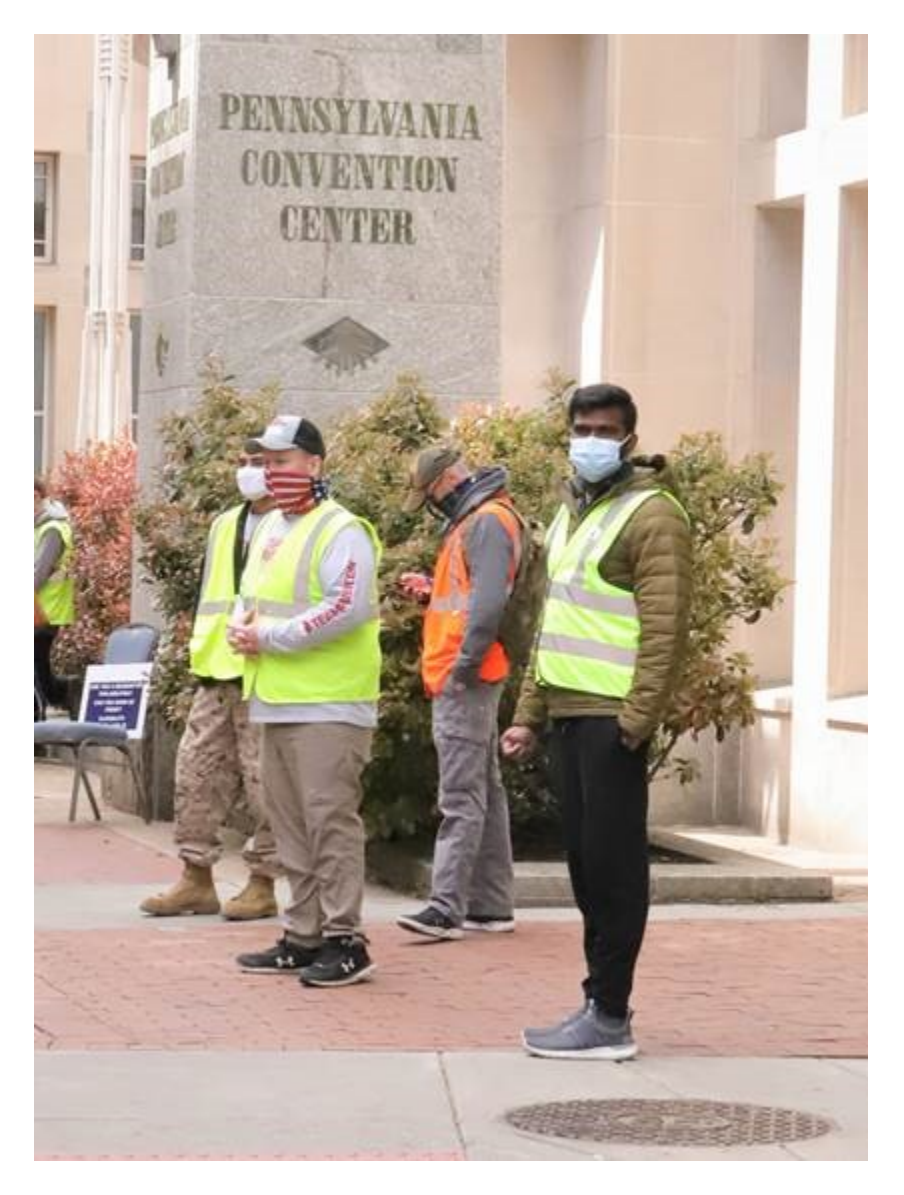
Caption: Sewa volunteers work alongside other volunteer organizations, like Team Rubicon, as well as the Pennsylvania National Guard to support the Center City Vaccination Center.

Caption: Sewa volunteers conduct community outreach by canvassing in neighborhoods across Philadelphia to spread awareness about the Esperanza Community Vaccination Center and Center City Vaccination Center in Philadelphia, PA.