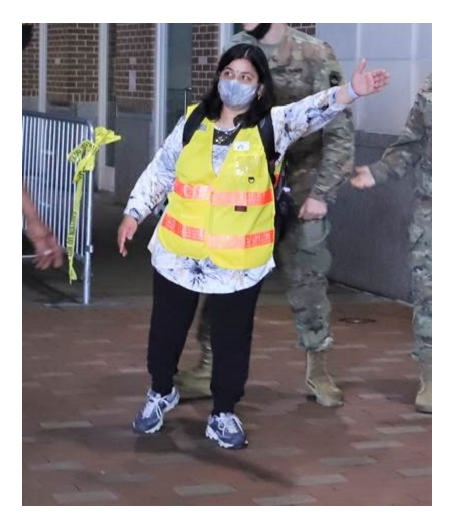
Caption: A Sewa volunteer manages traffic control at the state-run, federallysupported Center City Community Vaccination Center in the Pennsylvania Convention Center in Philadelphia.