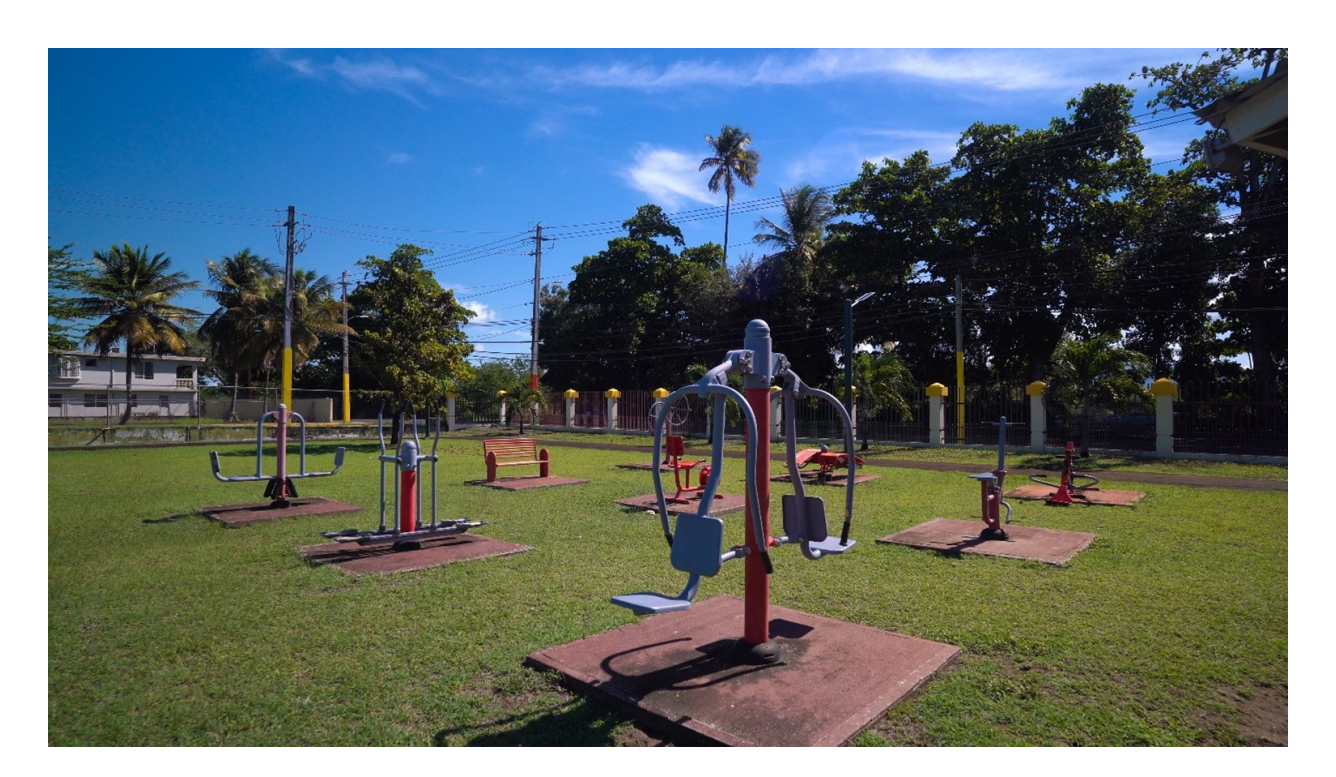
LOÍZA, Puerto Rico (November 23, 2021) – In the municipality of Loíza, for example, work was completed on the Santillana del Mar recreational park with an obligation of over $35,000.