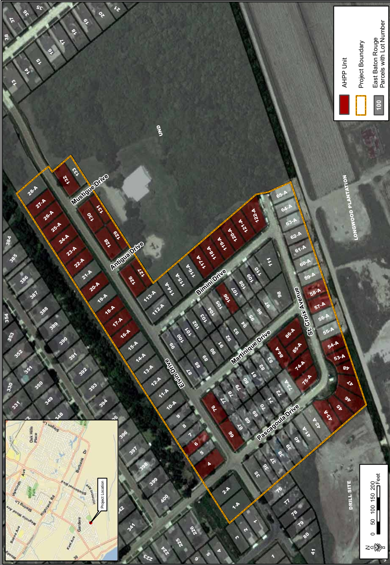
Figure 2: Baton Rouge - Hidden Cove AHPP Proposed Site Map