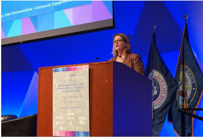
FEMA Administrator Deanne Criswell's Flagship Address describes the importance of listening in emergency management.

The summit showcased the science, lived experiences, gaps and opportunities in communications and community engagement that unite all risk and crisis communicators. Communicators identified best practices, exchanged knowledge and formed new networks that will enhance our collective ability to help people before, during and after disasters.