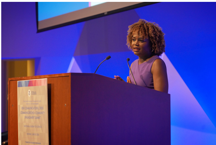
White House, Press Secretary Karine Jean-Pierre delivering the keynote address.

White House, Press Secretary Karine Jean-Pierre