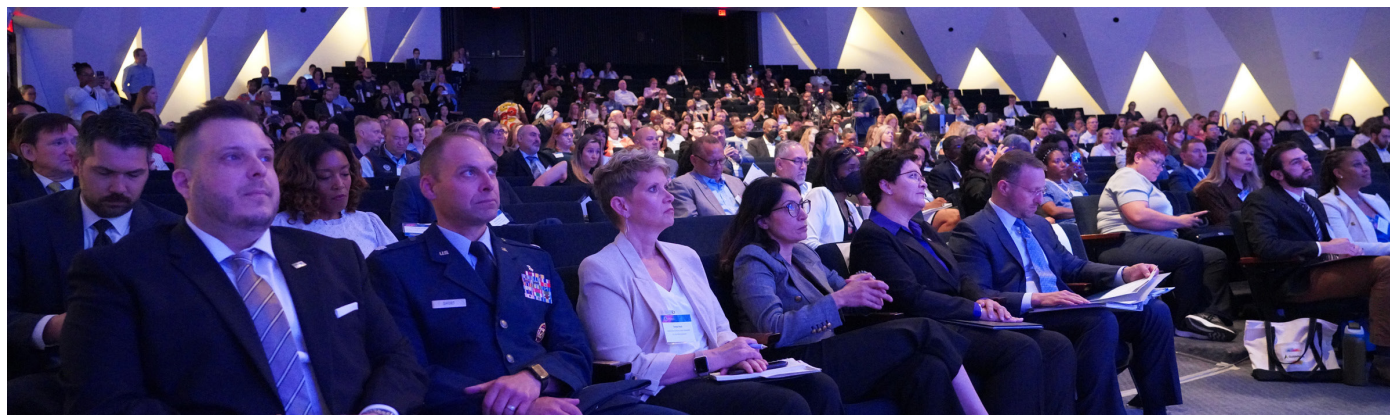
The audience filled the auditorium at the National Academy of Sciences, listening as FEMA Administrator Deanne Criswell delivered the flagship address.

Sign up for the FEMA National Communicators Collective.