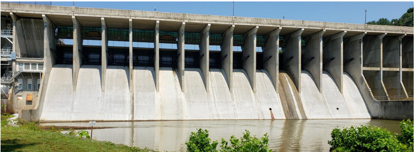
Brighton Dam, Maryland.

Remember! As you review the ways to meet plan requirements, be sure to protect all sensitive and/or personally identifiable information.