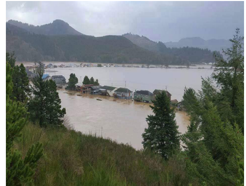
The National Flood Insurance Program serves to protect lives and property, while reducing costs to taxpayers due to flooding loss.

FEMA is evaluating proposed changes to the NFIP outlined in the Implementation Plan through an environmental impact statement (EIS), in compliance with the National Environmental Policy Act (NEPA).