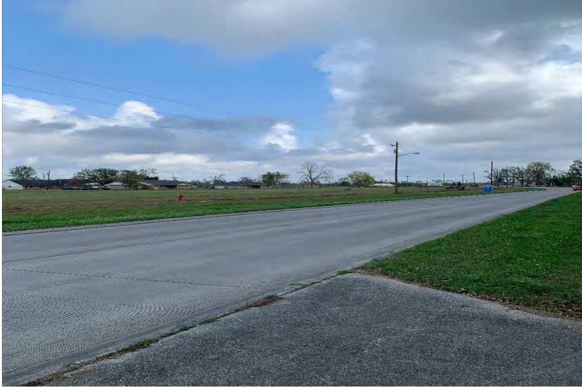
Figure 5: Photograph of Existing Site Conditions at the Proposed 1187 Bayou Gardens Blvd Group Site Facing Northeast