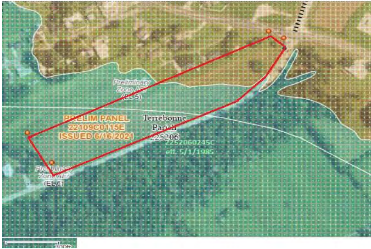
Figure 3: 1187 Bayou Gardens Blvd Flood Insurance Rate Map