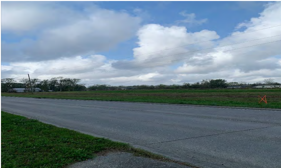
Figure 6: Photograph of Existing Site Conditions at the Proposed 1187 Bayou Gardens Blvd Group Site Facing Northwest