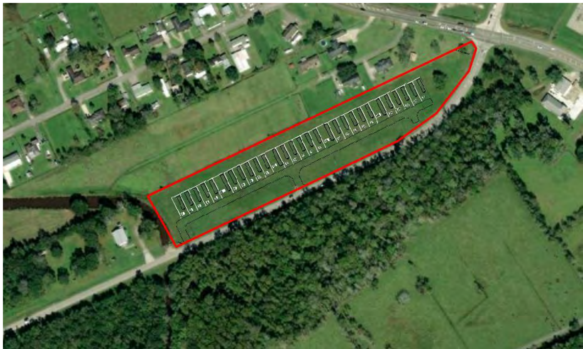
Figure 2: 1187 Bayou Gardens Blvd Group Site Proposed Layout