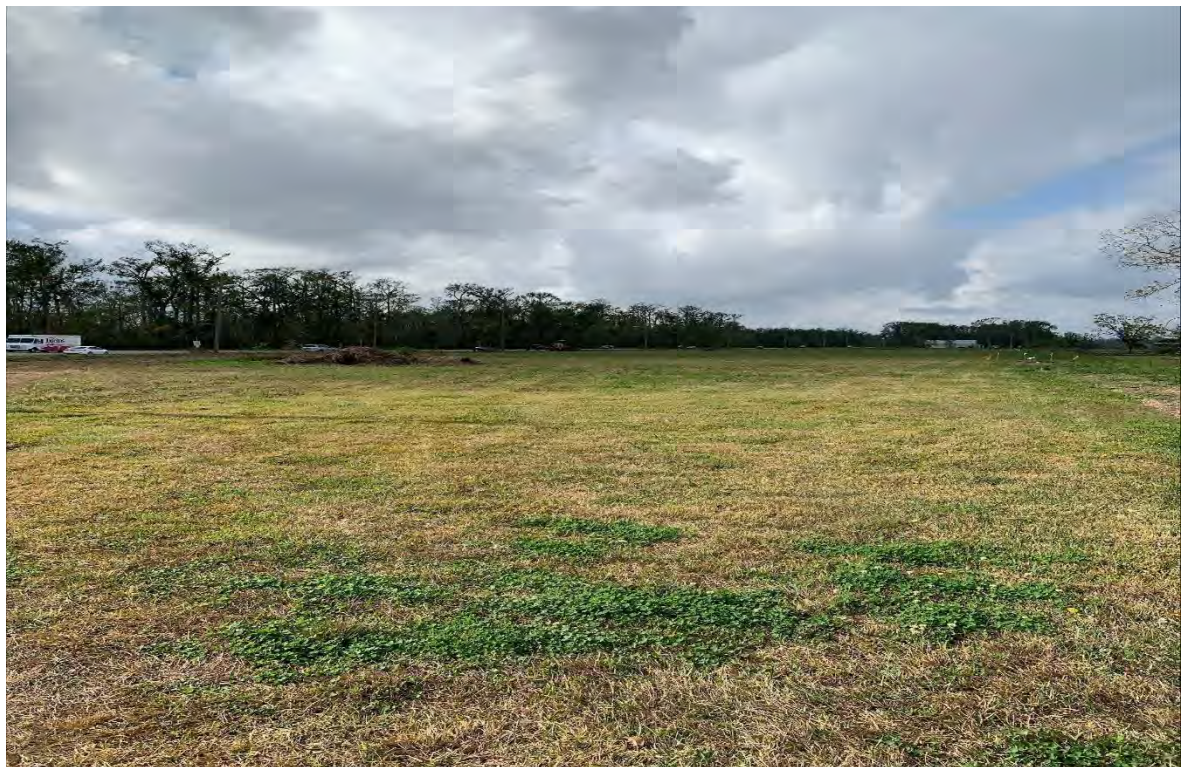
Figure 4: Photograph of Existing Site Conditions at the Proposed 1187 Bayou Gardens Blvd Group Site Facing Southwest