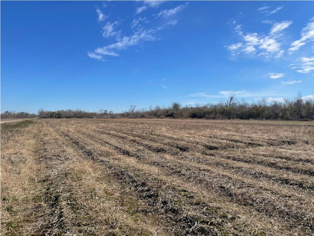
Figure 5: Photograph of Existing Site Conditions at the Proposed 4909 Highway 3127 Group Site Facing East