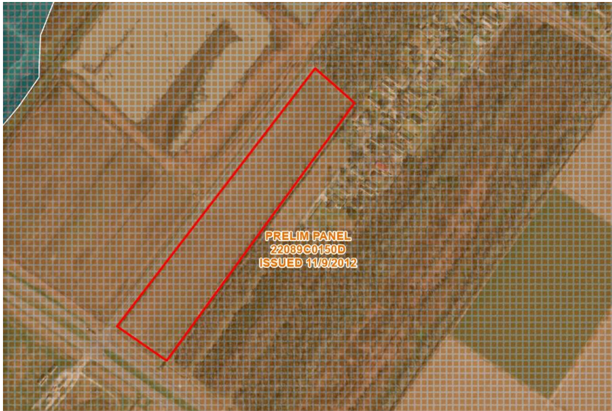
Figure 3: 4909 Highway 3127 Flood Insurance Rate Map (FIRM)