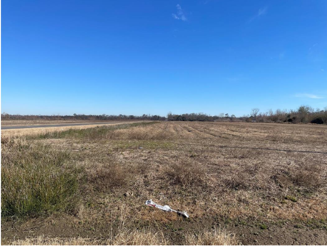
Figure 4: Photograph of Existing Site Conditions at the Proposed 4909 Highway 3127 Group Site Facing Northeast