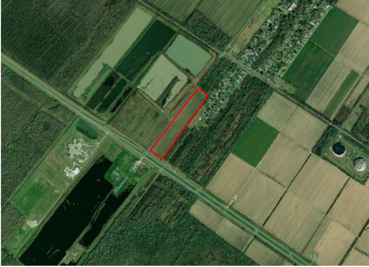
Figure 1: Aerial Photo and Vicinity of Proposed 4909 Highway 3127 Group Site