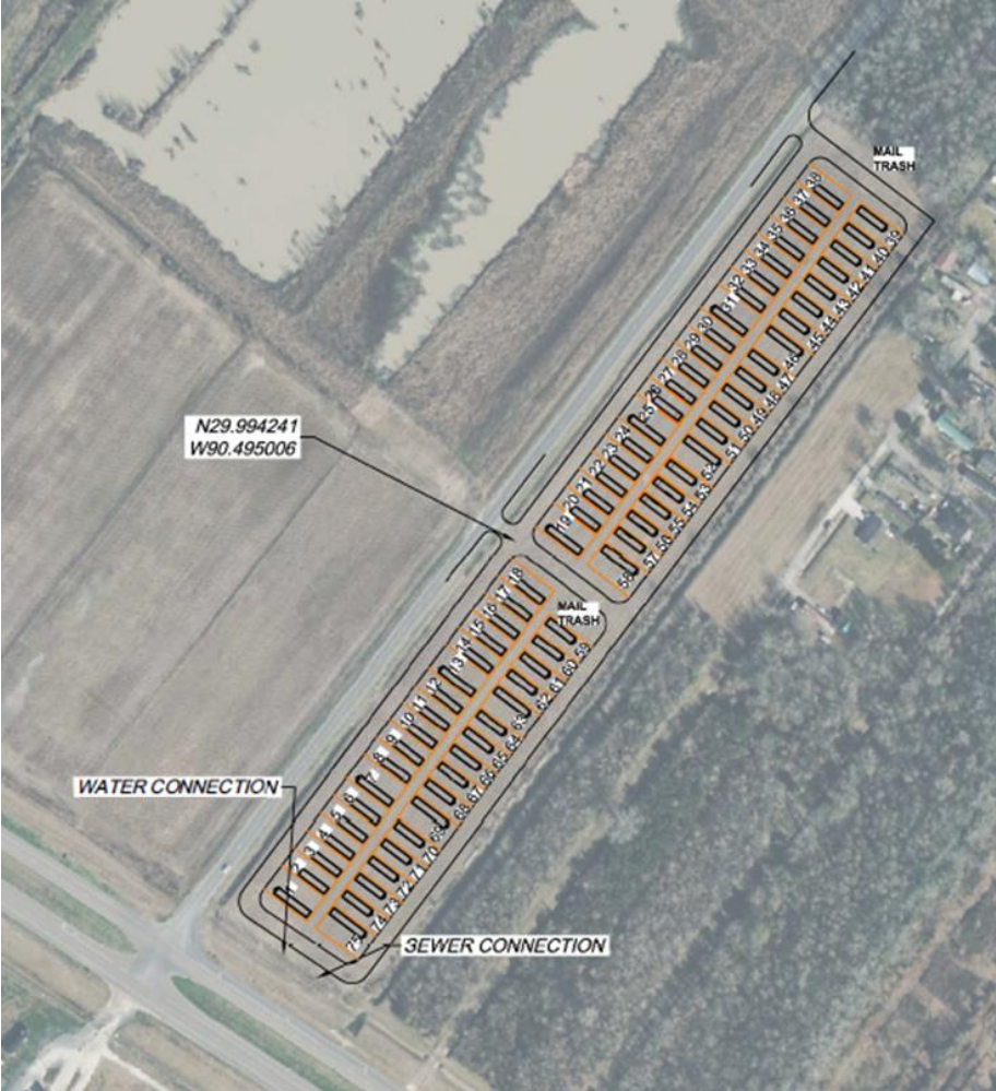
Figure 2: 4909 Highway 3127 Group Site Proposed Layout