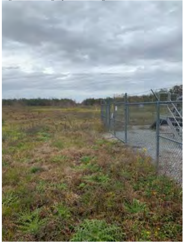
Figure 5: Photograph of Existing Site Conditions at the Proposed 2519 W Park Ave Group Site Facing East