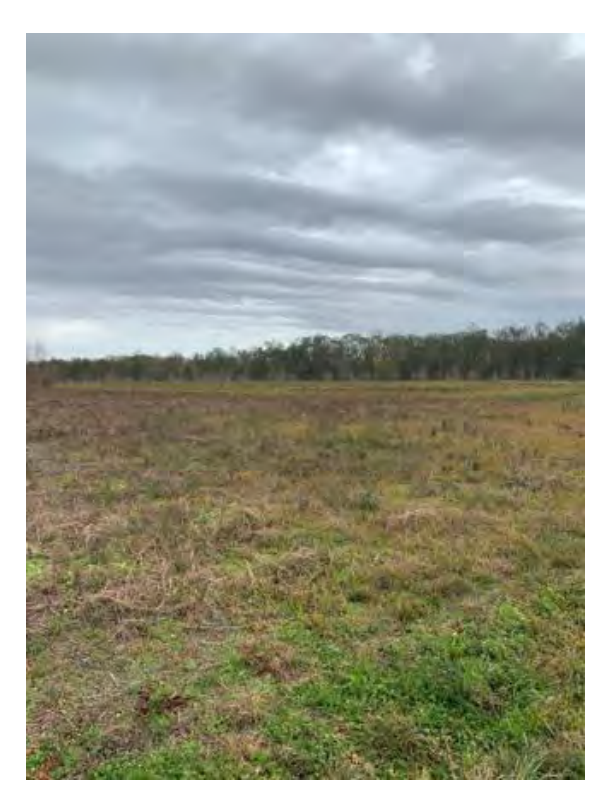
Figure 4: Photograph of Existing Site Conditions at the Proposed 2519 W Park Ave Group Site Facing Southeast