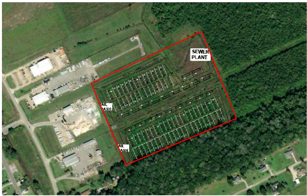
Figure 2: 2519 W Park Ave Group Site Proposed Layout