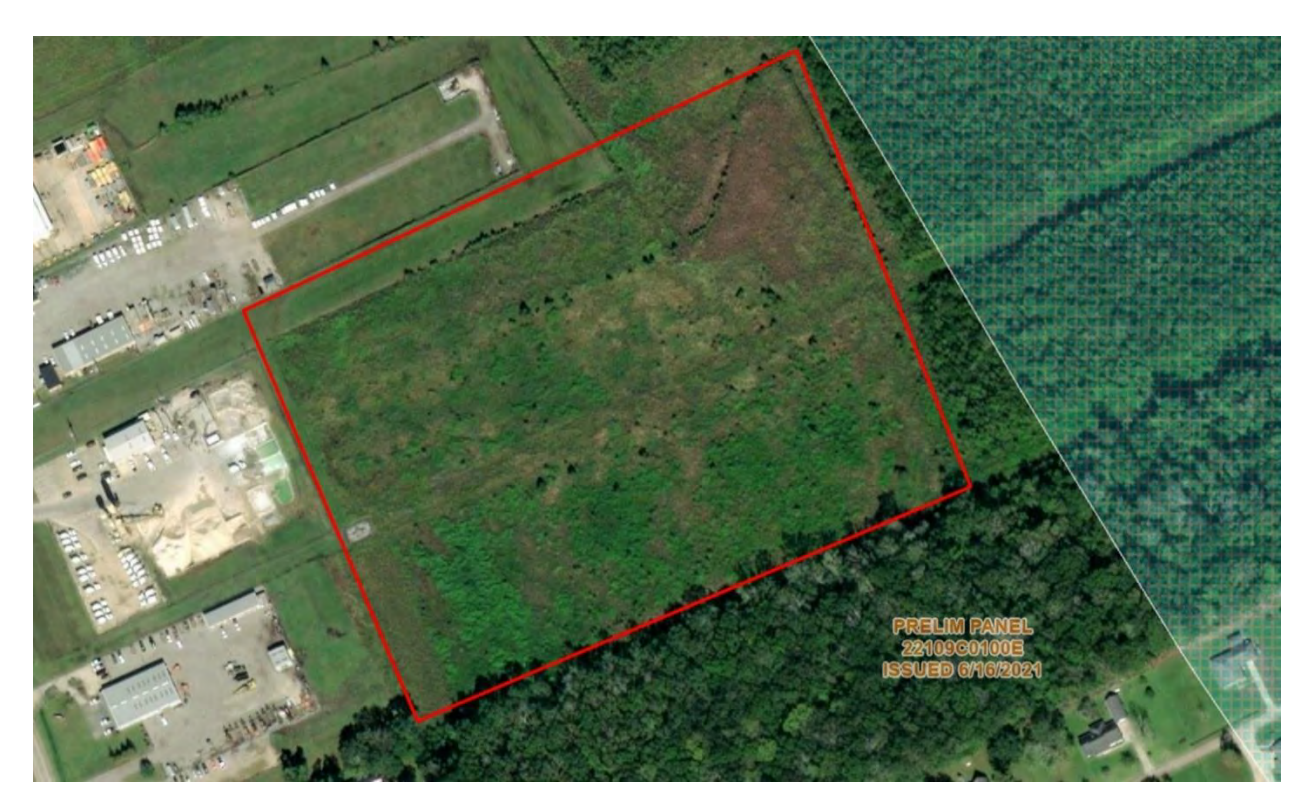
Figure 3: 2519 W Park Ave Flood Insurance Rate Map (FIRM)