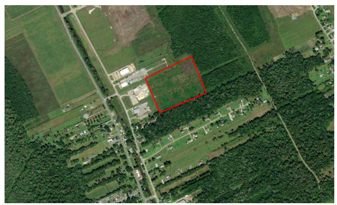
Figure 1: Aerial Photo and Vicinity of Proposed 2519 W Park Ave Group Site