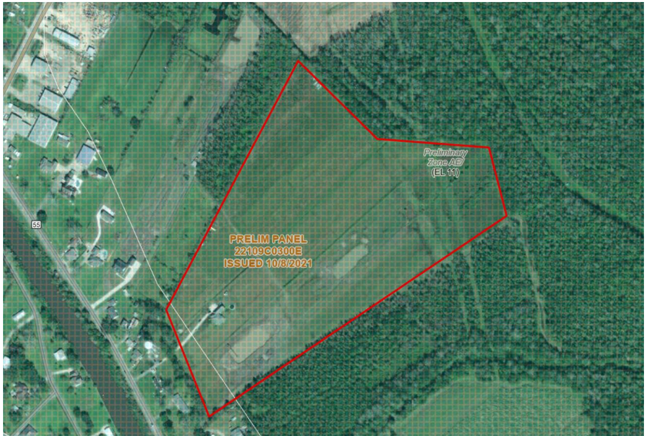
Figure 3: 145 HWY 55 Group Site Flood Insurance Rate Map (FIRM)