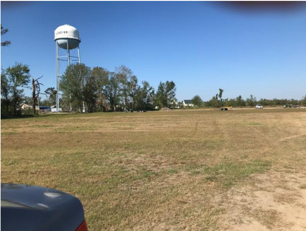
Figure 5: Photograph of Existing Site Conditions at the Proposed 145 HWY 55 Group Site Facing Northwest