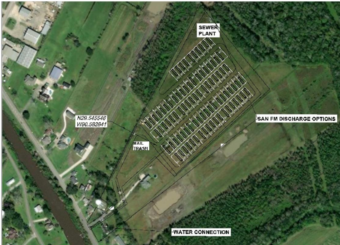
Figure 2: 145 HWY 55 Group Site Proposed Layout