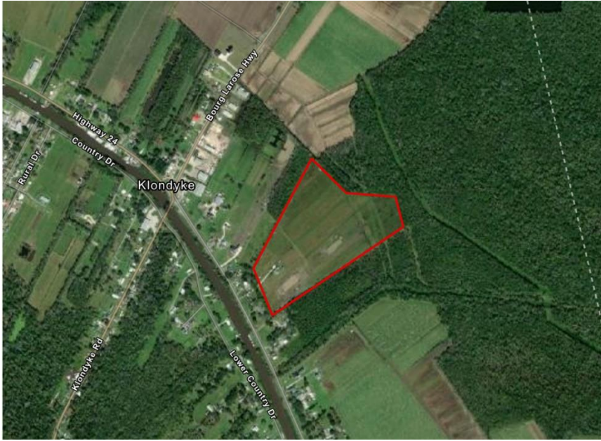
Figure 1: Aerial Photo and Vicinity of Proposed 145 HWY 55 Group Site