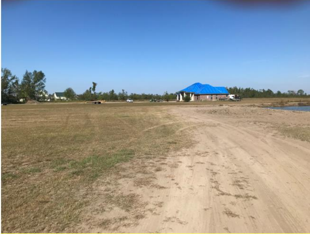
Figure 4: Photograph of Existing Site Conditions at the Proposed 145 HWY 55 Group Site Facing West