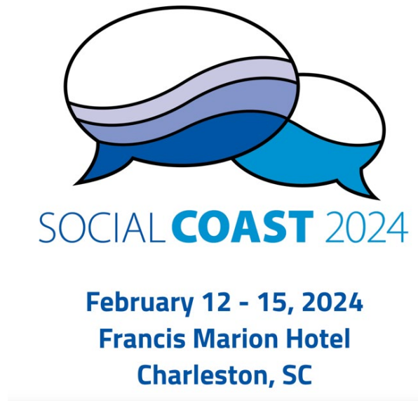
Figure 1. FEMA co-led session flyer held in Charleston, SC

Climate change is making it harder to manage coastal communities, public systems, and the environment. It can affect human health, food security, transportation, the economy and the environment. However, for many Americans, the impacts of climate change can feel overwhelming.