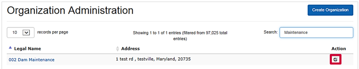
Figure 2. Click the Update Organization icon to begin updating organization details

Click the Update Organization icon in the Action column. This will open the Update Organization detail page.