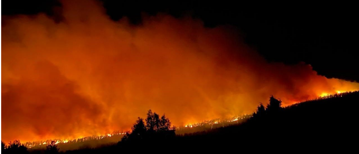
The Fire Near Holman, New Mexico, the Night of May 8, 2022