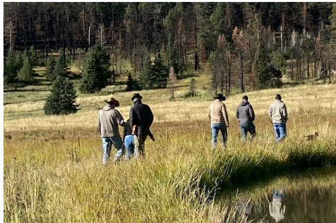
Reassessing a Plan for a Landowner

The partnership with NRCS benefits the Claims Office: the cost estimation methodology is known, reasonable, consistent, and equitable for all claimants who choose to submit an NRCS plan for payment. Through the partnership with NRCS, the Claims Office has been able to deliver more for claimants, and more quickly, than it ever could have on its own. NRCS staff estimate that implementing the program has cost millions of dollars—but NRCS has a workforce that understands the toolbox of conservation practices. For the Claims Office to recruit or contract for a similar capability in house would have taken substantially more time; it is unlikely that the Claims Office would have been able to compensate claimants as quickly and fairly without the assistance of NRCS.