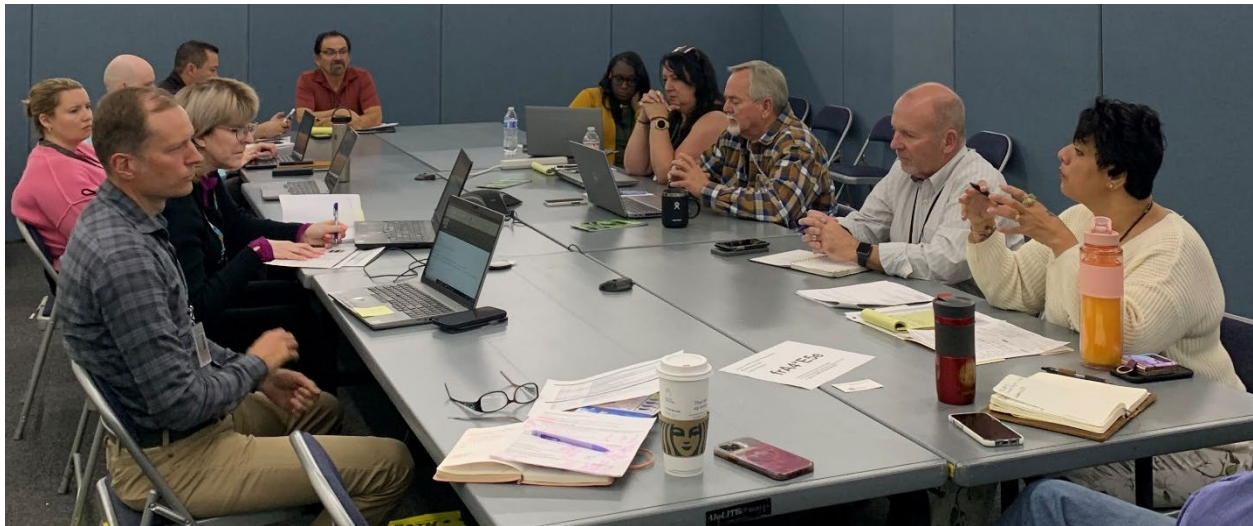
Advocate’s Office and FEMA Individual Assistance Program Staff Discuss Housing Needs

The Advocate’s Office also participates in meetings and working groups with a variety of stakeholder groups and community organizations, including the Acequia Association, 100% Mora, and 100% Las Vegas (these last two dedicated to ensuring that 100 percent of their county residents have access to vital services), to establish collaborative working relationships of mutual trust. By engaging with a variety of stakeholder groups, the Advocate’s Office can hear community concerns, understand resources available to help claimants, and develop solutions that leverage those resources to extend the Claims Office’s impact on individual and community recovery.