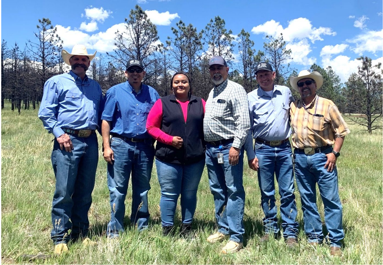
Staff from the Advocate's Office and NRCS Who Led This Effort