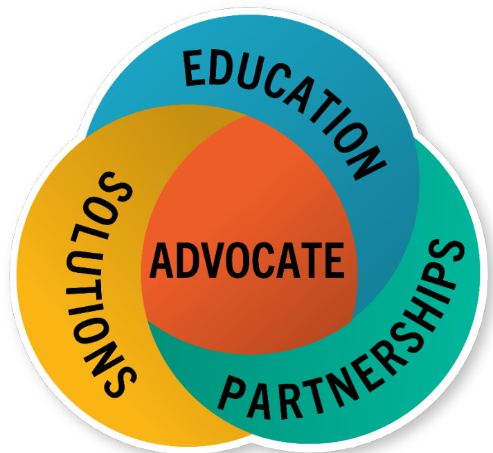
Fulfilling the Mission of the Advocate’s Office Involves Education, Partnerships, and Solutions