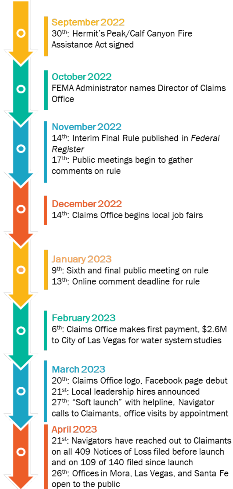
Timeline of the Claims Office’s Initial Development

The Claims Office launched on March 27, 2023—roughly a year after the fire started and six months since the Act had become law. The Claims Office activated its helpline, Navigators began contacting those claimants who had previously submitted Notices of Loss, and claimants could make appointments for in-person discussions. On April 26, 2023, the Claims Office opened sites to the public in Mora, Las Vegas, and Santa Fe.