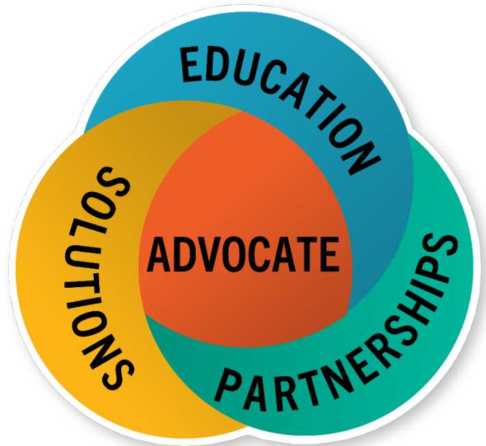
Fulfilling the Mission of the Advocate’s Office Involves Education, Partnerships, and Solutions