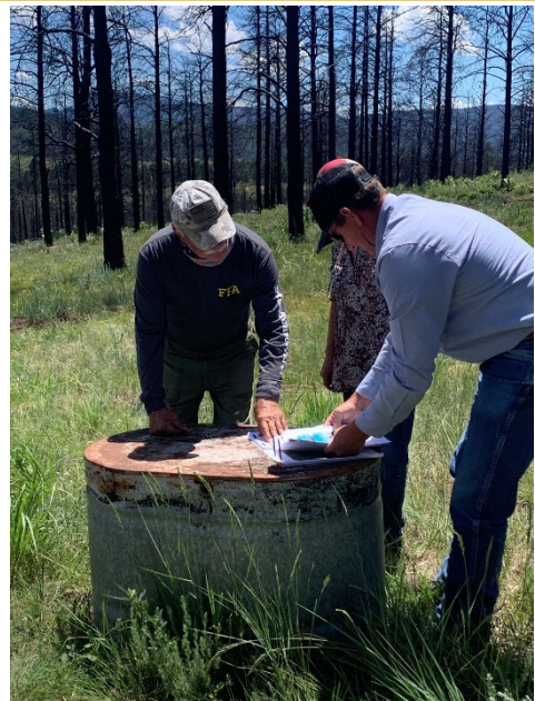
Delivery of a Conservation Restoration Plan for Signature

Within the U.S. Department of Agriculture (USDA), NRCS supports America’s working lands by delivering conservation solutions for farmers, ranchers, and forest landowners to protect and sustain the natural resources on which agriculture depends. NRCS has 150 employees and 34 offices in the State of New Mexico, plus longstanding relationships with landowners from delivering multiple NRCS programs. NRCS also had, according to State Conservationist Xavier Montoya, “a huge desire to offer something claimants could put to beneficial use.”