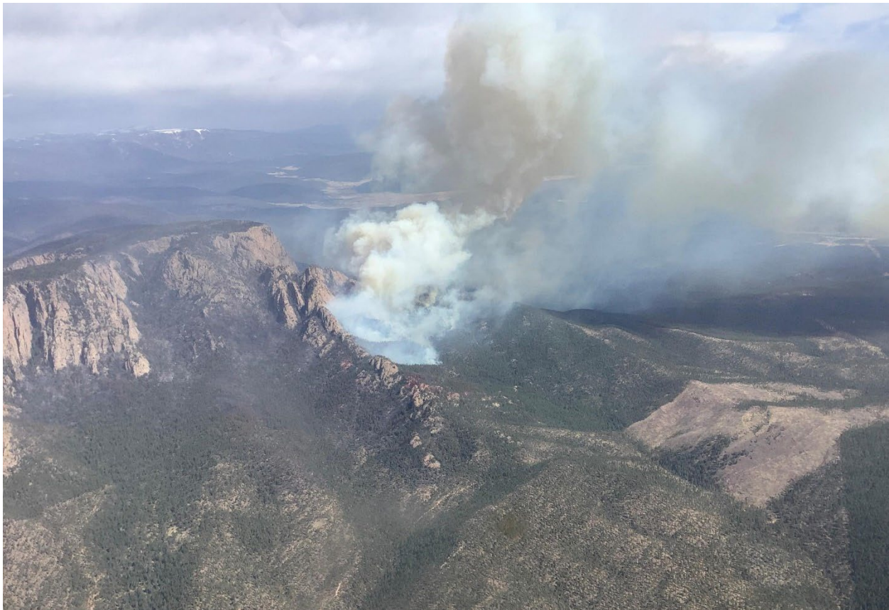
Aerial View of the Hermit’s Peak Fire the Morning of April 10, 2022

Due in part to severe drought conditions in the region, the combined fire would not be fully contained until August 21, 2022, by which time it had become the largest wildfire in New Mexico’s history. The fire burned more than 340,000 acres of land, most of it privately owned, including millions of trees and more than 900 structures. Thousands of residents of Mora and San Miguel counties had been subject to mandatory evacuation orders for the fires. Burning of vegetation and soil also contributed to flood damage following the fire and runoff of debris and contaminants into water supplies, complicating water treatment.