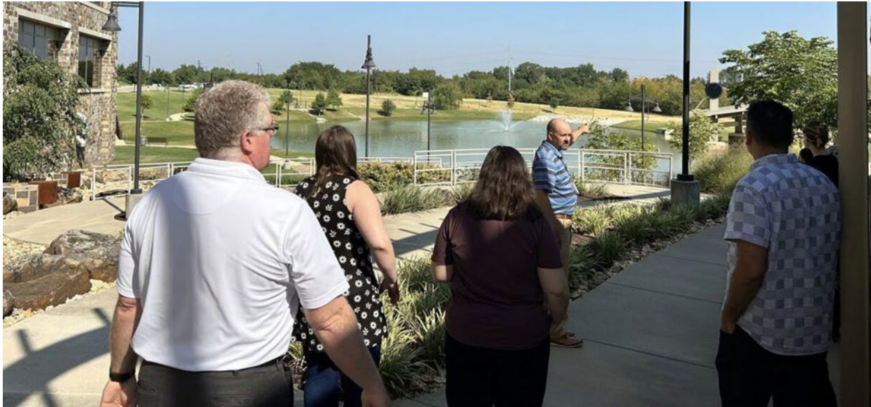
Figure 2. ESWG Members on a Tour of the Choctaw Nation Headquarters.