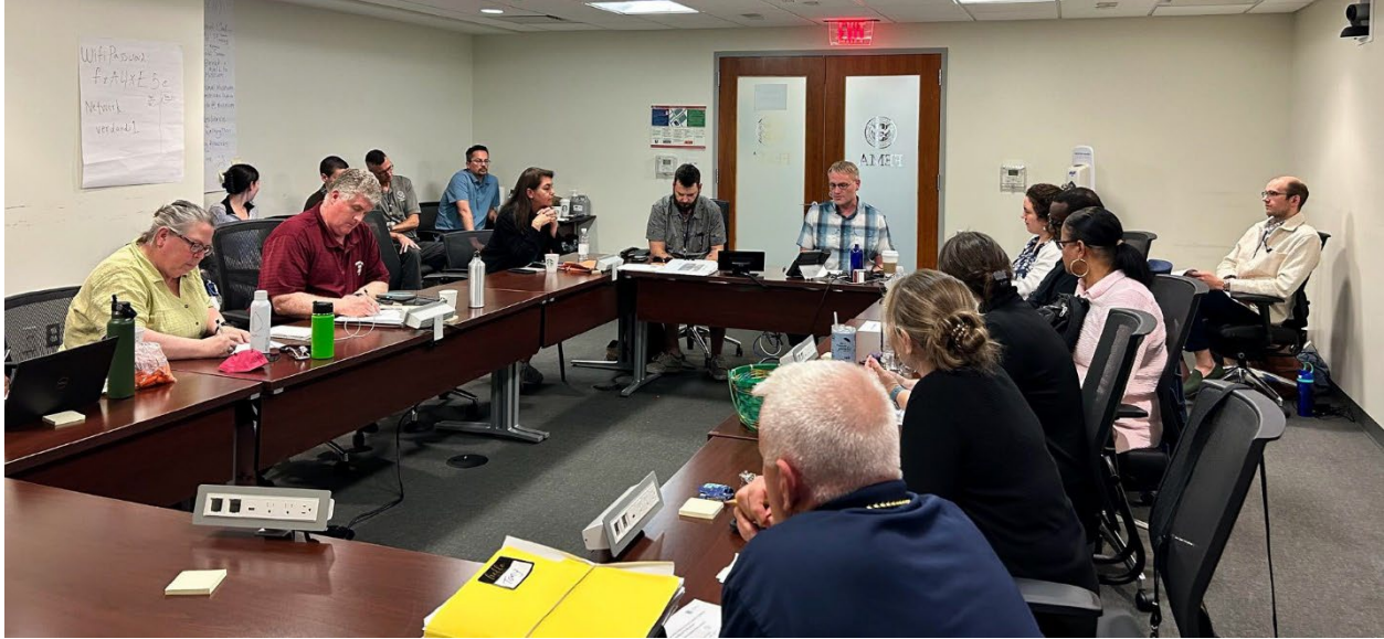
Figure 1. ESWG Members Gather at FEMA Headquarters in Washington, DC for Quarter Two Meeting Workstream Working Sessions.