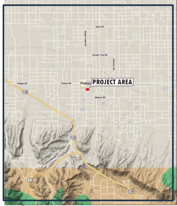
Figure 1 – Project location

The EOC would be part of the newly constructed Civic Center in the unincorporated Phelan Piñon Hills community in San Bernardino County. The Civic Center will be located at the intersection of Warbler Road and Sheep Creek Road (Figure 1). The "Project Area" for the purposes of this analysis includes the parcel of land to be developed as the Civic Center (see Figure 2) described as Assessor's Parcel Number (APN) 3066-261-10 Parcel 1 and is 4.65 acres. All proposed areas of disturbance for the Proposed Action will be confined to the boundaries shown in Figure 3. The Project Proponent plans to develop the eastern adjacent 14 acres as a community park in the future. The Project Area is currently surrounded by vacant land and commercial development (restaurant, auto parts store, community center, community park). The Project Area and surrounding properties are all zoned General Commercial (CG).