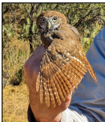
Cactus Ferruginous Pygmy Owl.

Project approvals and permits are often needed from the USACE.