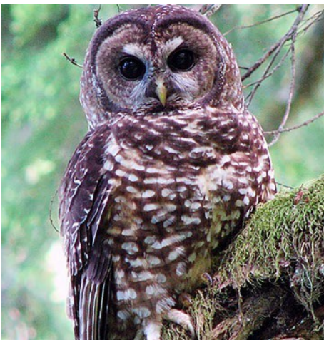
Figure 2: Northern Spotted Owl ( Strix occidentalis caurina )

Under the Endangered Species Act (ESA), for any project that has the potential to affect federally threatened or endangered species and/or their habitats, FEMA must consult with the U.S. Fish and Wildlife Service (USFWS) or National Marine Fisheries Service (NMFS). Typically, this process results in the development of measures to avoid or minimize impacts to such species and/or habitats.