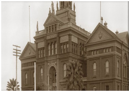
Figure 3: San Diego County Courthouse (1889)

All proposed projects that have the potential to affect historic properties must be reviewed by FEMA and the Tribal Historic Preservation Officer (THPO). A historic property is any precontact or historic district, building, site, structure, or