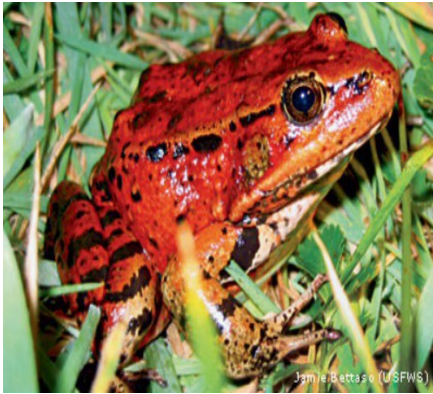
Figure 1: California Red-legged Frog ( Rana draytonii )

The Clean Water Act (CWA) apply to actions affecting “waters of the United States”. This includes any part of a surface water system: natural waters including oceans, seas, bays, lagoons, streams, lakes, and wetlands; as well as isolated human-made waters. The U.S. Army Corps of Engineers (USACE) regulates this law.