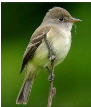
Southwestern willow flycatcher

Under the Endangered Species Act, any project that may have the potential to affect federally threatened or endangered species must coordinate with the USFWS to develop measures to avoid and/or minimize impacts to such species. Endangered species are in danger of extinction throughout the area and habitats in which they usually occur. Threatened species are those that could become endangered in the near future. Arizona has over 60 federally endangered, threatened, proposed or candidate species (listed species).