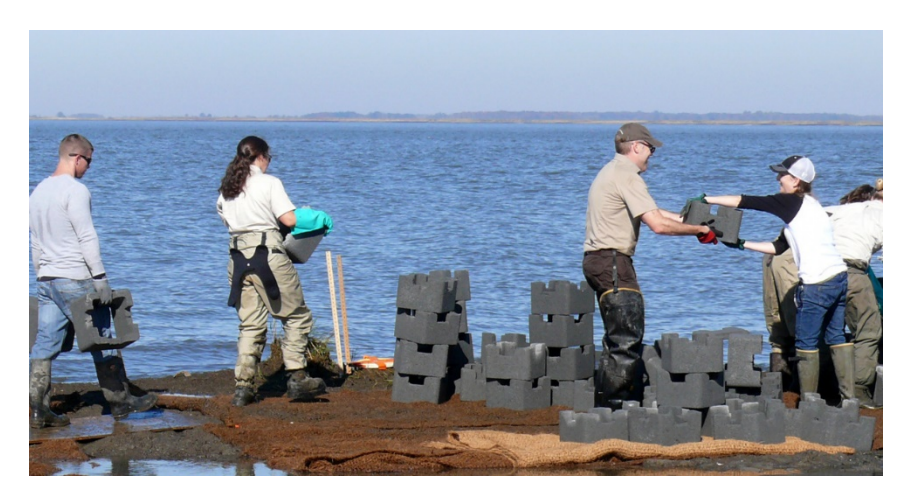
Figure 6. A federal agency that has been a partner in the Sandy recovery effort is the Department of the Interior, which has invested in hundreds of resilience projects throughout the Atlantic Coast and worked with partners to stabilize beaches, restore wetlands and improve the hydrology of coastal areas. These efforts help protect local residents from future storms while creating jobs, engaging youth and veterans, and restoring habitat for wildlife.

Finally, the SRIRC prompted and sustained a high-level, outcome-focused approach to disaster recovery. Because the SRIRC was convening diverse stakeholders and reporting out to multiple groups (including the FEMA Recovery Support Function Leadership Group [RSFLG] and the White House Task Force), they were able to elevate and bring attention to issues that arose during disaster recovery. The outcome-driven conversations that started within the SRIRC continued long after the group stepped back, providing localities with the framework and risk-reduction mindset to apply for other grant programs and leverage the coordination started by the SRIRC to get sustainable, innovative infrastructure projects off the ground years later.