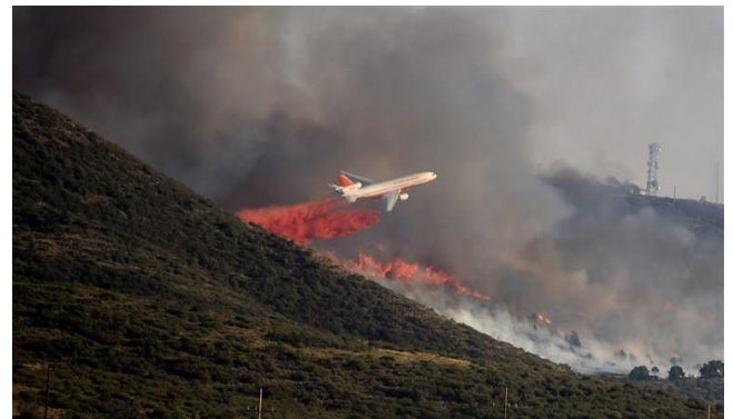
Figure 2. Firefighting efforts in Yarnell, Arizona in 2013.

Through the working group, the Arizona Corporation Commission, USDA Rural Development, and the National Rural Water Association assessed the current state of the water supply and relevant infrastructure systems and identified available financial resources, including consolidated and restructured loan options for the privately-owned water infrastructure. The stakeholders worked together to effectively reorganize the private co-op's debt by expediting loan