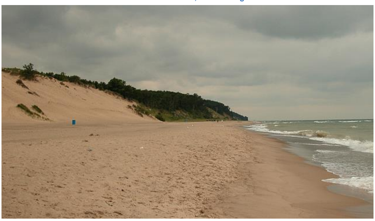
Figure 3: Sample of a Large Relic Dune, Mount Baldy, Indian Dunes National Lakeshore, Lake Michigan

Debris may be entrained in tidal floodwaters and cast inland by storm surge and wave propagation. Natural debris consists of floating woody debris, such as drift logs, branches, cut firewood, and other natural floatable materials. Wave-cast beach sediments, such as cobbles and gravel, also constitute natural debris.