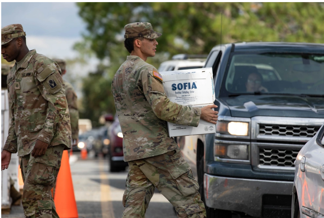
Suwannee, Florida – National Guard distributes commodities and supplies to people impacted by the storm in several points of distribution in hard hit areas in the state.