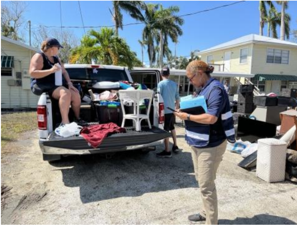
Bradenton, Fla. (Sept. 29, 2024) - FEMA Disaster Survivor Assistance Teams help survivors of Hurricane Helene.