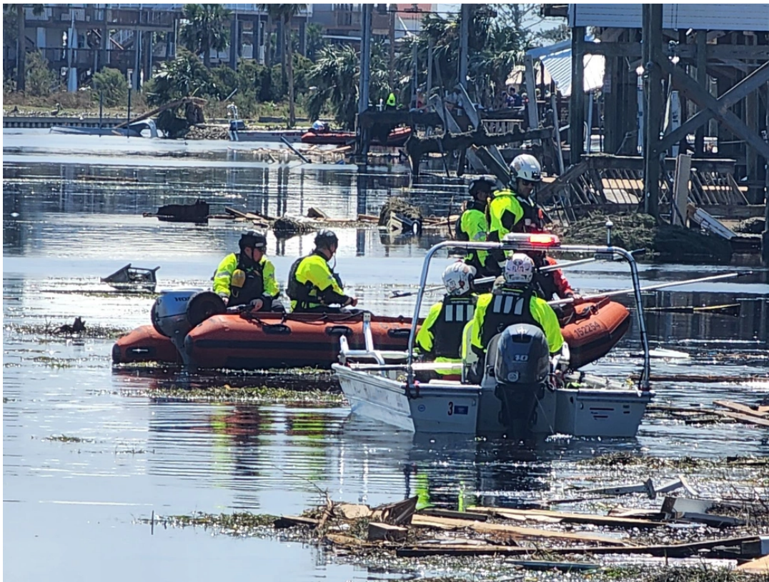
Big Bend Region, Florida - Coast Guard personnel from the Gulf Strike team and Station Pascagoula conducting urban search and rescue operations alongside federal and state partners to assist stranded people.

Raleigh, NC - Gov. Roy Cooper holds press conference to announce the approval of an expedited major disaster declaration by President Joseph R. Biden.