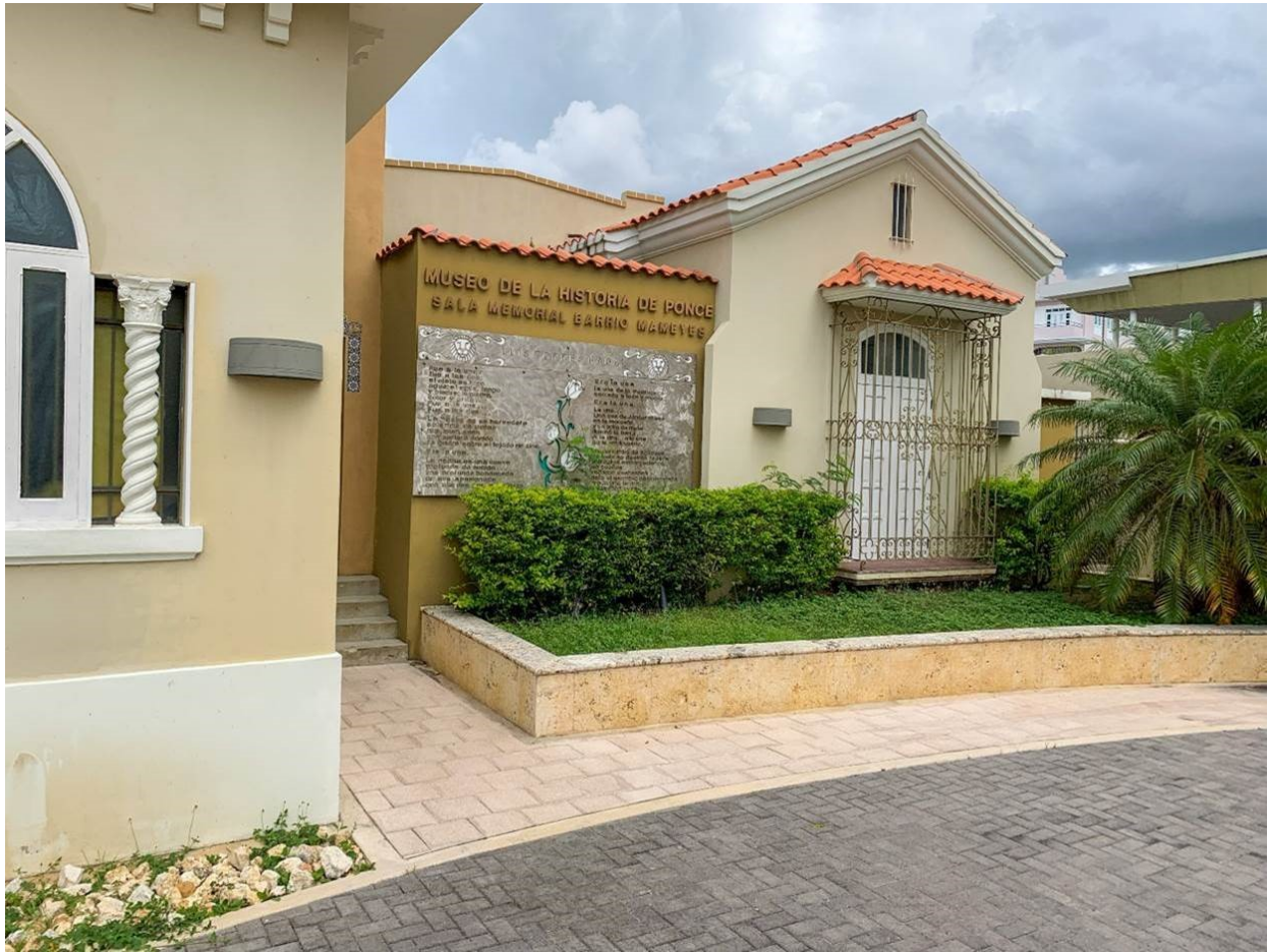
PONCE, Puerto Rico – Another $102,000 approved by FEMA will help repair the Casa Zapater, the Barrio Mameyes Memorial Hall and Casa Salazar museums in Ponce.