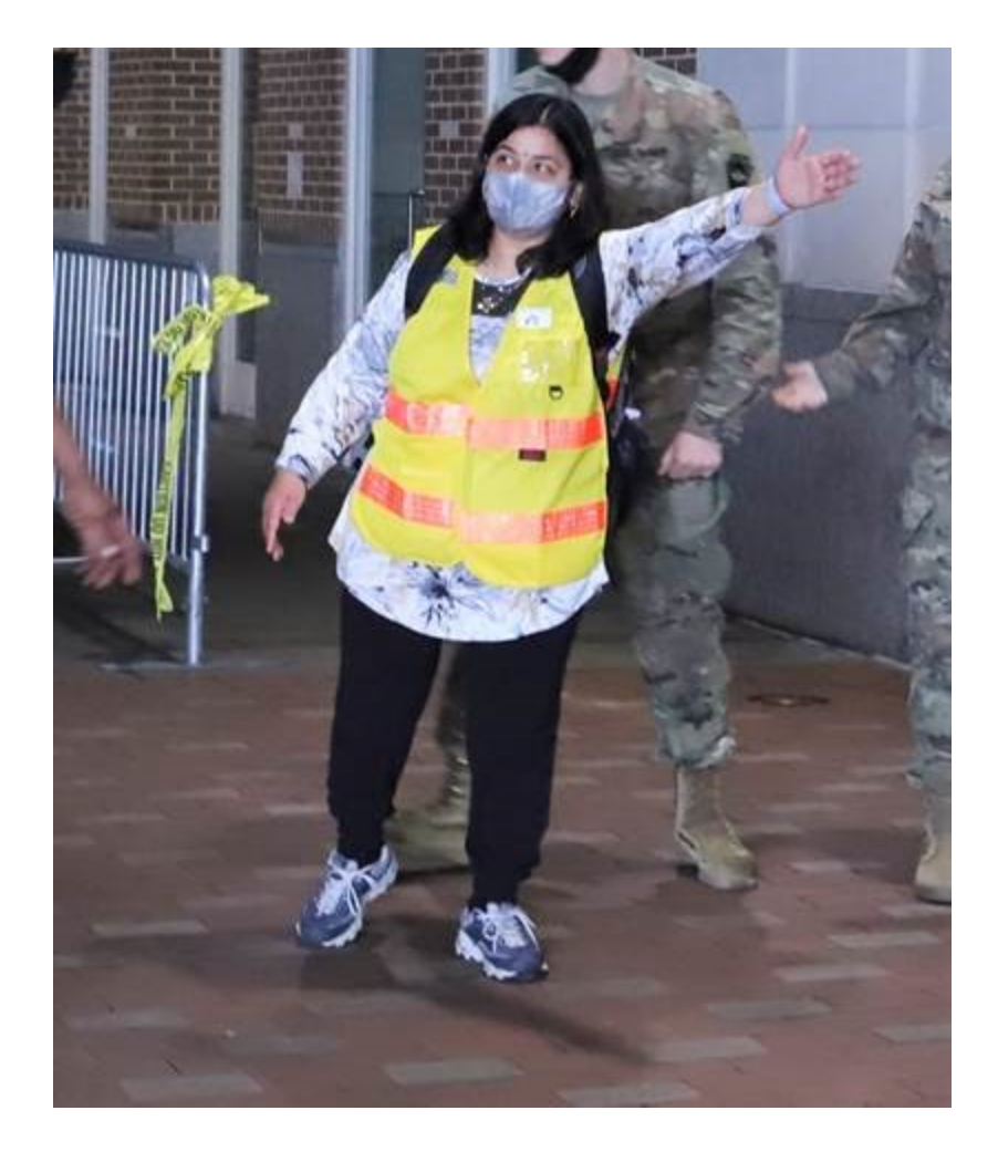
Caption: A Sewa volunteer manages traffic control at the state-run, federally-supported Center City Community Vaccination Center in the Pennsylvania Convention Center in Philadelphia.