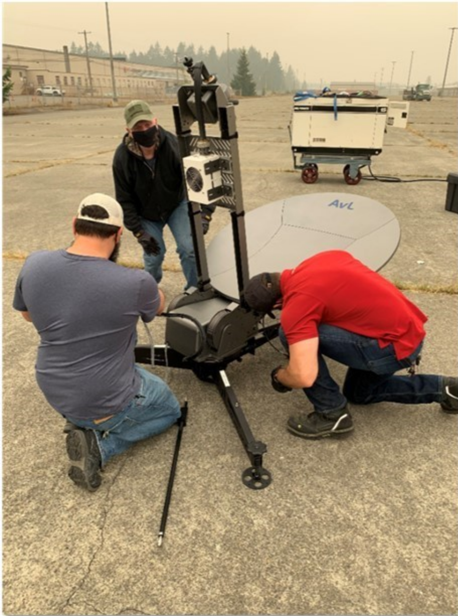
TACOMA, Wash. -- FEMA technicians assemble communications equipment for wildfire response coordination on Joint Base Lewis-McChord.