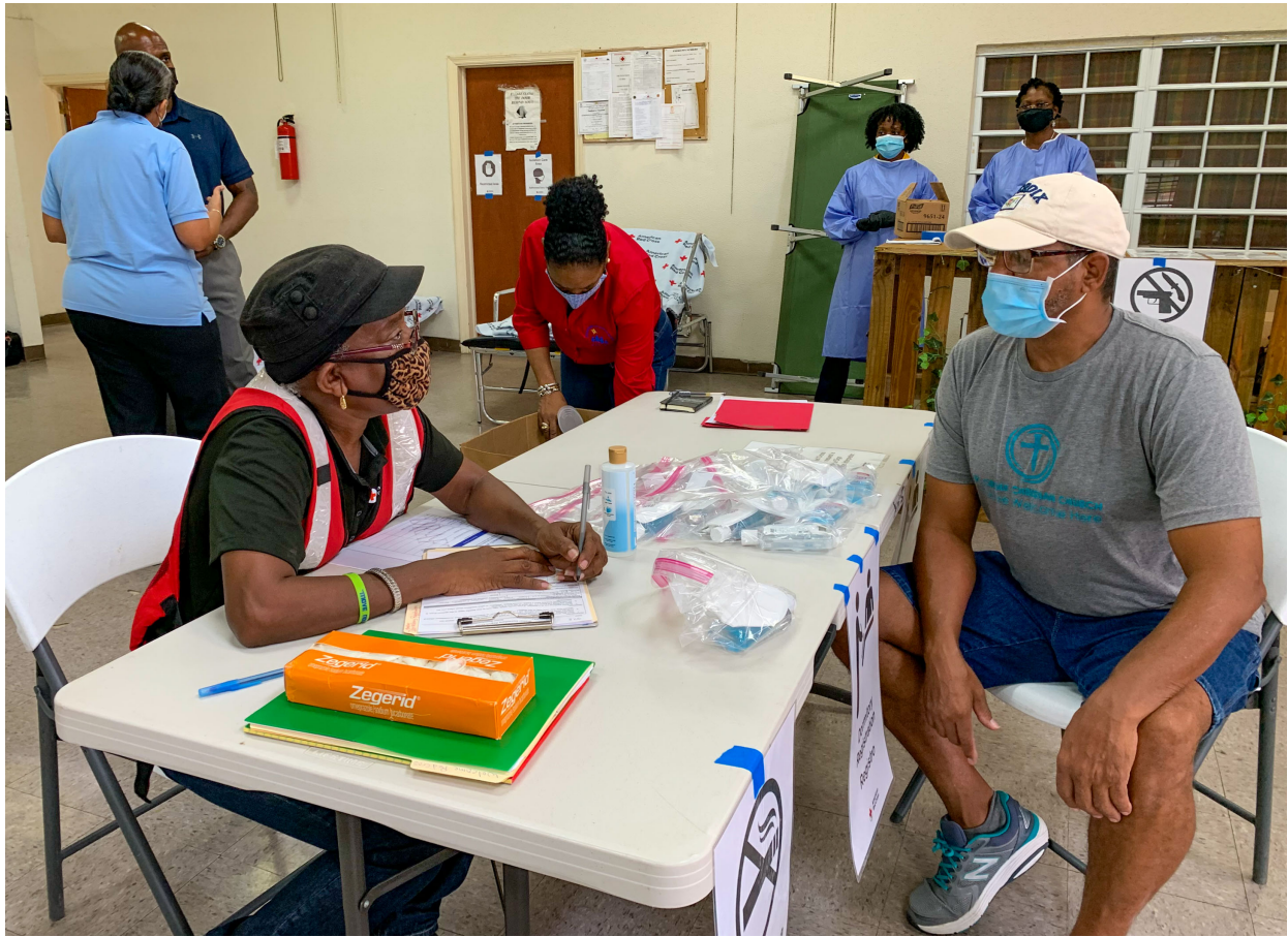
A volunteer role playing an evacuee looks to register at the D.C. Canegata Recreation Center shelter during an evacuation shelter drill. Members of the Voluntary Organizations Active in Disaster role played evacuees during the field exercise.