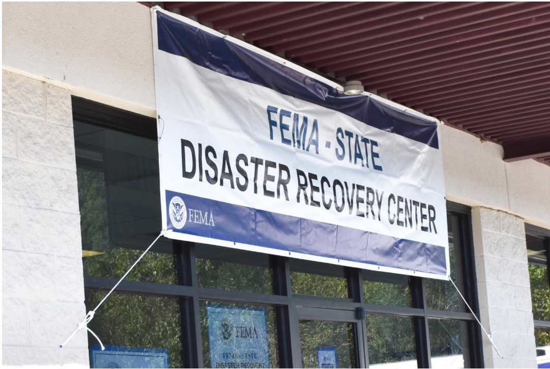
Sign outside of the Disaster Recovery Center in Washington County, Va.

FEMA has set up a rumor response webpage to clarify our role in the Helene response. Visit Hurricane Helene: Rumor Response .