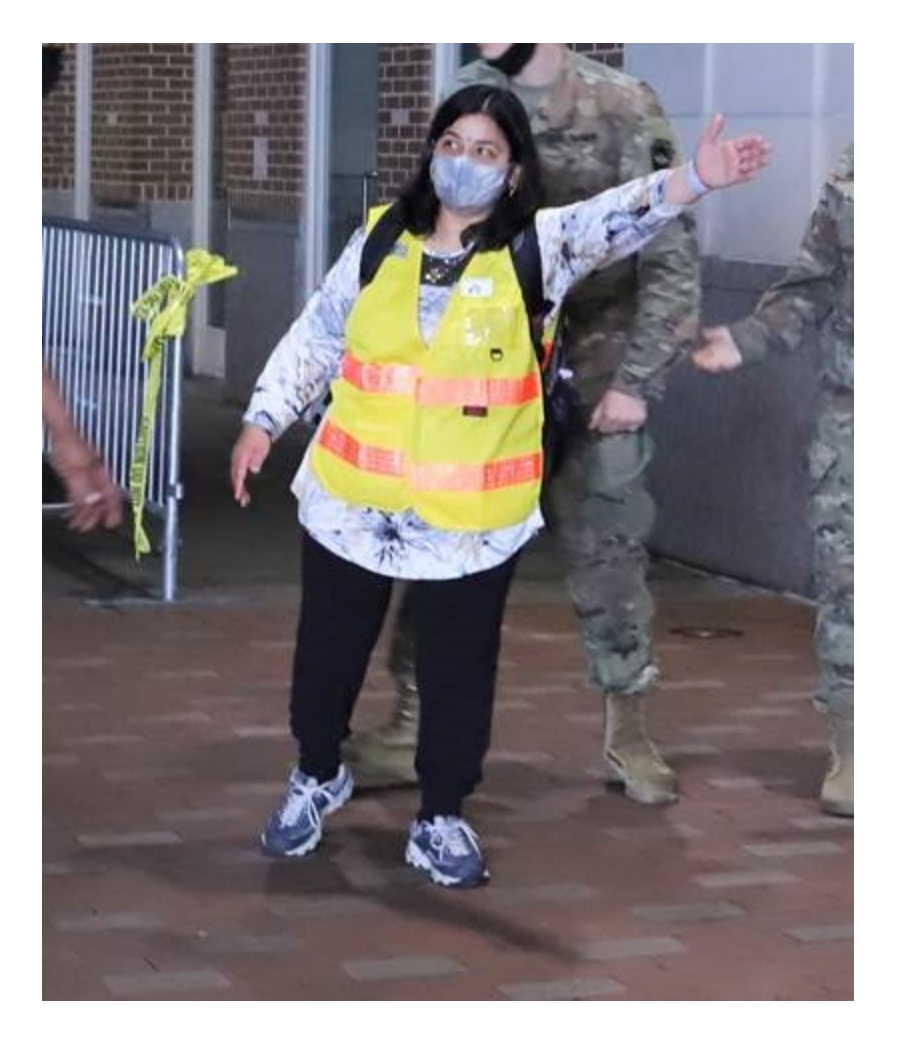
Caption: A Sewa volunteer manages traffic control at the state-run, federally-supported Center City Community Vaccination Center in the Pennsylvania Convention Center in Philadelphia.