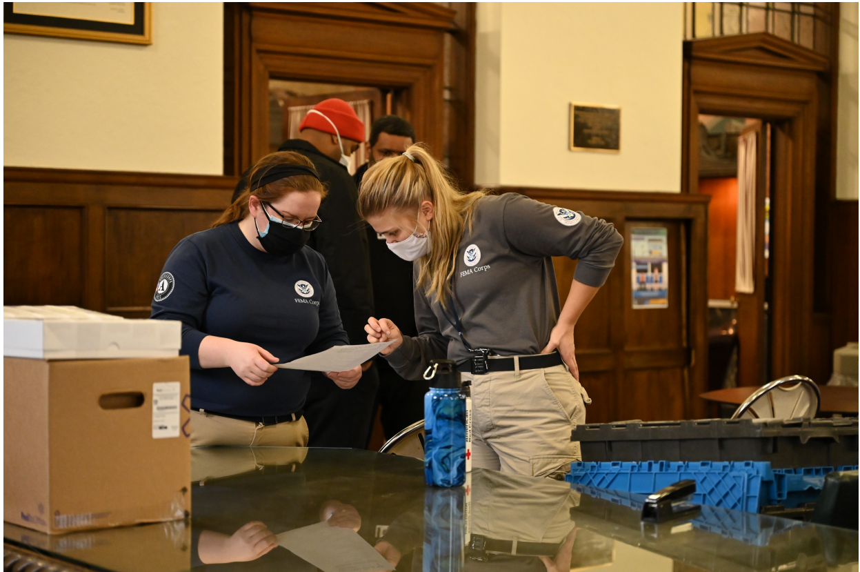
FEMA Corps Staff prepare COVID-19 Testing Stations at the Greater Philadelphia MLK Day of Service Event on January 17th, 2022 at Girard College.