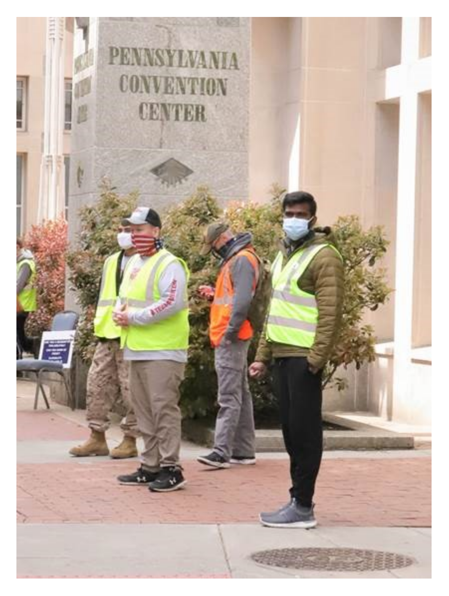
Caption: Sewa volunteers work alongside other volunteer organizations, like Team Rubicon, as well as the Pennsylvania National Guard to support the Center City Vaccination Center.

Caption: Sewa volunteers conduct community outreach by canvassing in neighborhoods across Philadelphia to spread awareness about the Esperanza Community Vaccination Center and Center City Vaccination Center in Philadelphia, PA.