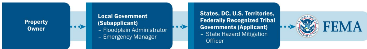
Figure 3: Swift Current Application Process Overview

The local government is considered the subapplicant and will develop a subapplication with any interested property owners. The local government will then submit the subapplication to appropriate state, tribal or territorial government on the property owner’s behalf. Tribal governments applying as applicants will work directly with FEMA to submit their application.