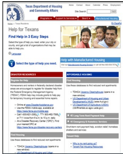
Figure 2: Screenshot of the State of Texas Housing Website

Messaging about the importance of flood insurance, homeowners and rental insurance and documentation of proof of ownership (e.g., deed, title, mortgage statement) can expedite disaster assistance. Jurisdictions and states should develop a communications strategy that includes preparedness activities and messaging in alternative formats, so everyone has access to information regarding services and assistance.