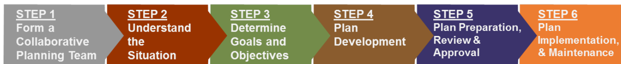
Figure 3: Six-Step Planning Process

CPG 101 provides a standardized planning process that SLTT jurisdictions can use to develop disaster housing plans that integrate and synchronize with existing operational and strategic planning products and efforts. This promotes consistency between plans and provides a familiar framework for stakeholders to engage and participate. Figure 3 depicts the Six-Step Planning Process from CPG 101.