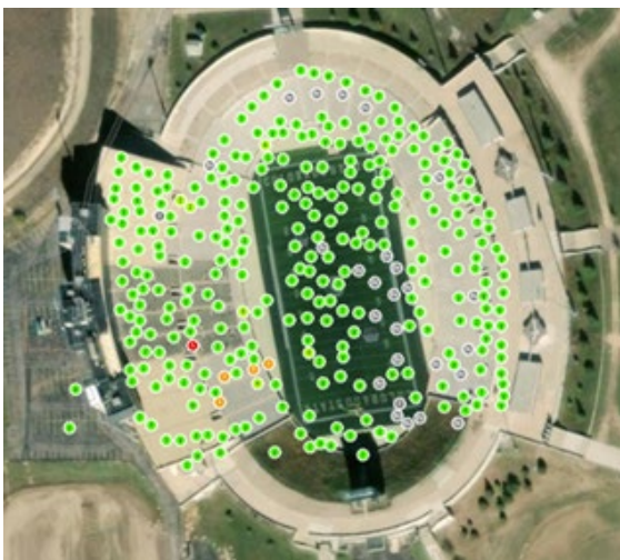
Figure 2. Colorado State Stadium Monitoring

Beginning in 2021 and continuing in 2023, the New Jersey Background Monitoring effort was undertaken to establish levels of background radiation in the state during National Background Week. Over 95,000 measurements were uploaded across two background weeks in a single event, with ~49,000 approved surveys and 223 rejected surveys. Responder tracking paths were successfully enabled for 21 responders with over 121,000 tracking points, and the field team and equipment API capabilities were utilized.