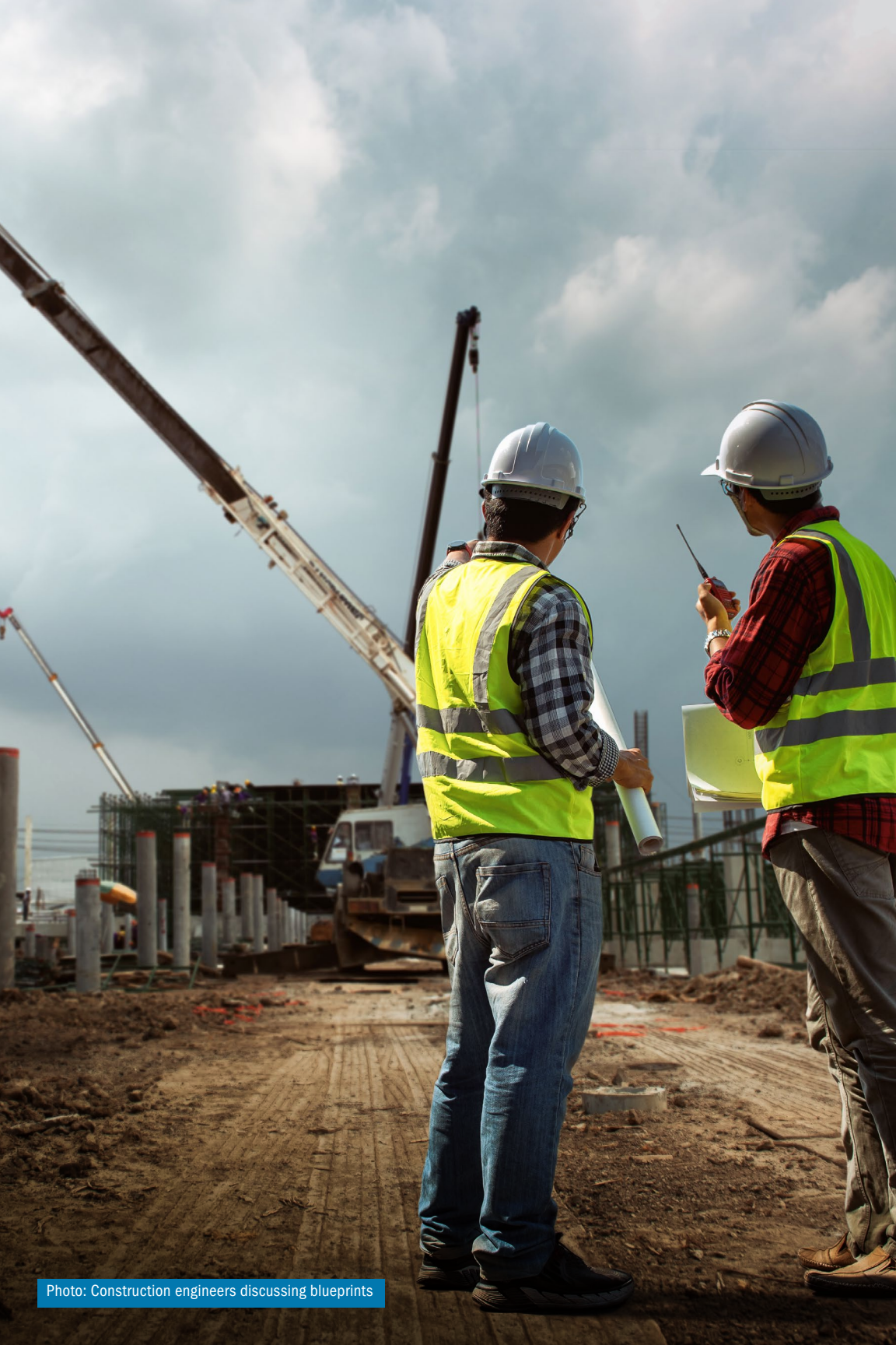
Photo: Construction engineers discussing blueprints