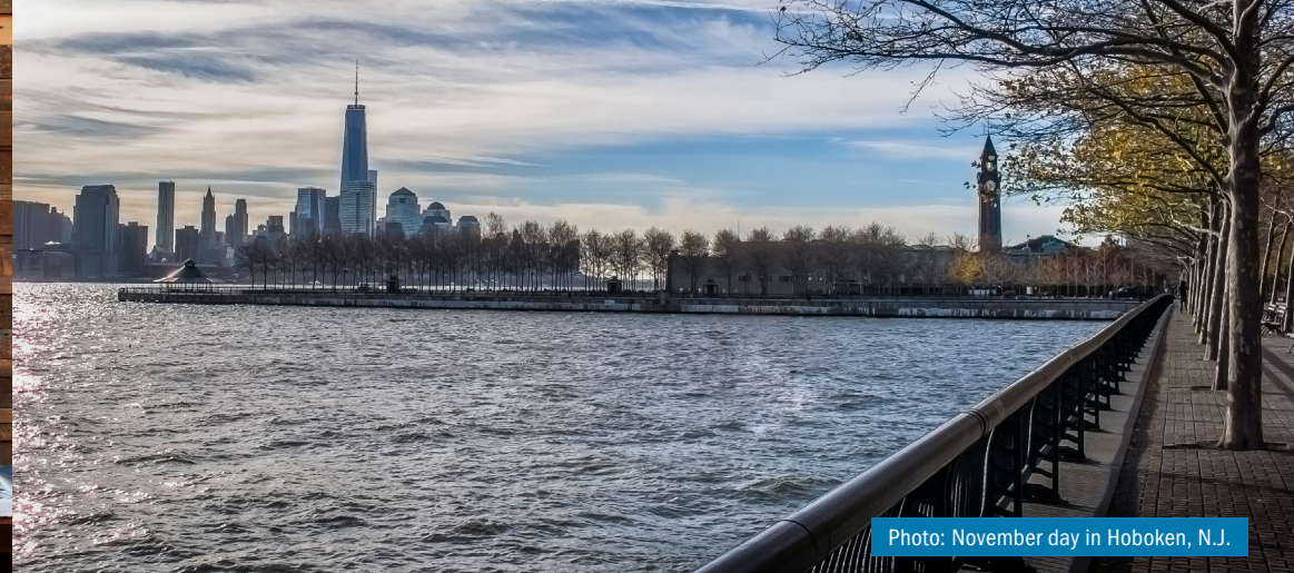
Photo: November day in Hoboken, N.J.