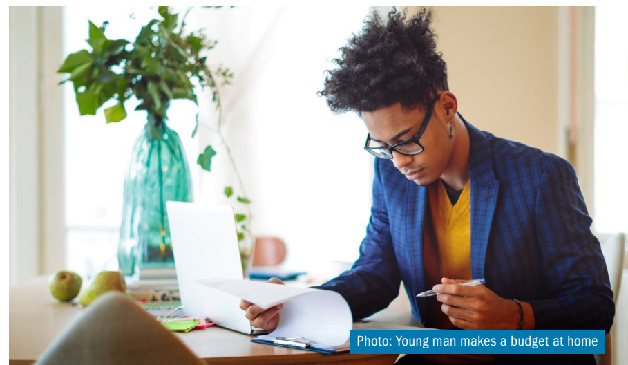
Photo: Young man makes a budget at home

Are you a state, local, tribal or territorial official interested in making the connection between finance and hazard mitigation? Are you a finance professional interested in connecting with local officials to reduce risk from hazards? Would you like guidance on mitigation funding sources or a copy of FEMA's Mitigation Resource Guide? Please contact us at FEMA-ExpandingMitigation@fema.dhs.gov .