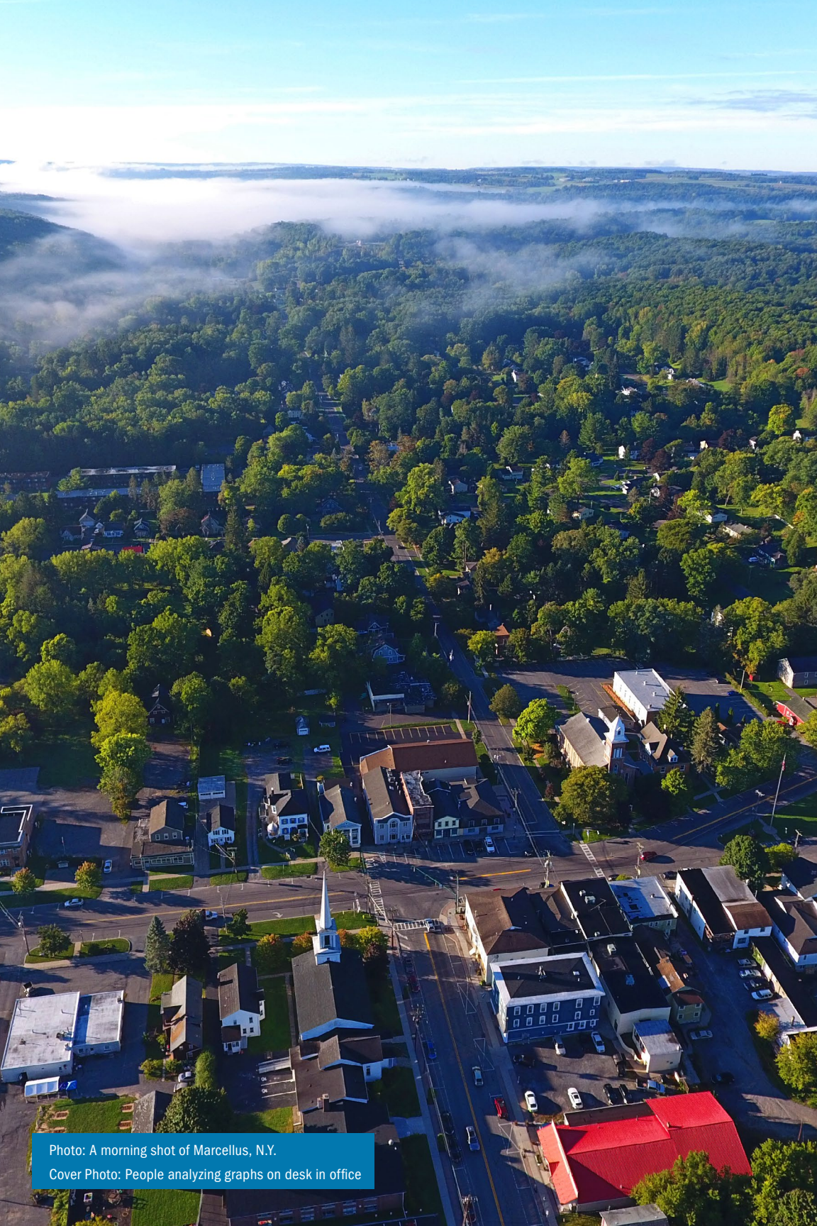
Photo: A morning shot of Marcellus, N.Y.