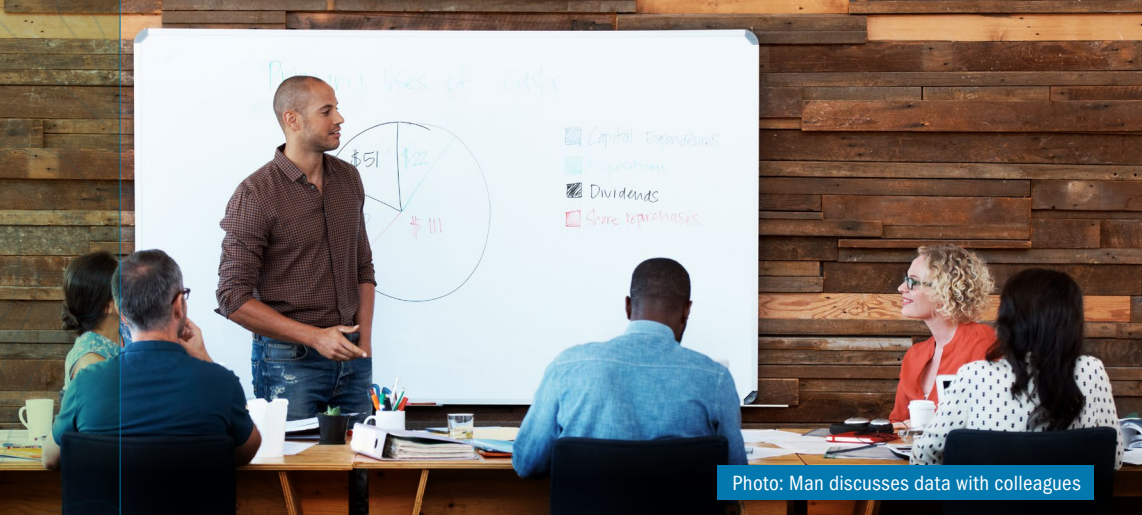
Photo: Man discusses data with colleagues