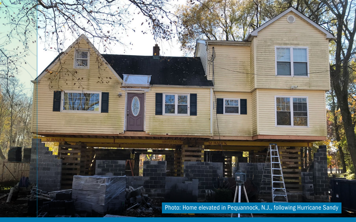
Home elevated in Pequannock, N.J., following Hurricane Sandy