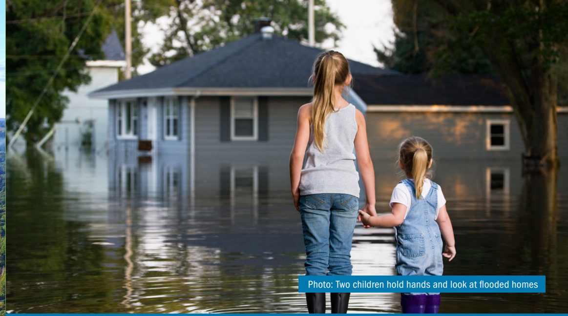
Photo: Two children hold hands and look at flooded homes

Disasters are difficult to predict. When they strike, their impacts can have long-term consequences for residents and the community. To reduce the impact of future disasters and improve the resiliency of your community, it is important to invest in mitigation. As you advance through the hazard mitigation planning process, exploring options that will reduce your community's risk it is critical to identify funding options for these efforts. Creating a funding strategy from multiple diverse sources will help to secure the funding necessary to keep your community safe from future disasters.